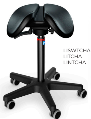
LISWTCHA LITCHA LINTCHA