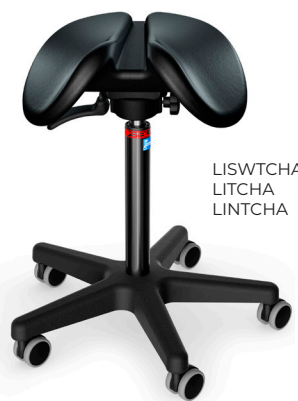
LISWTCHA LITCHA LINTCHA