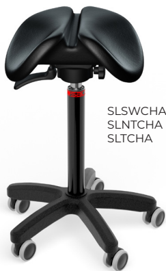
SLSWCHA SLNTCHA SLTCHA