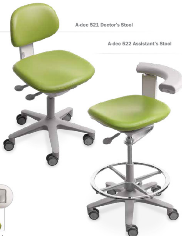
A-dec 522 Assistant's Stool