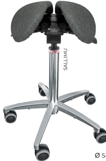
Ø 540 mm base