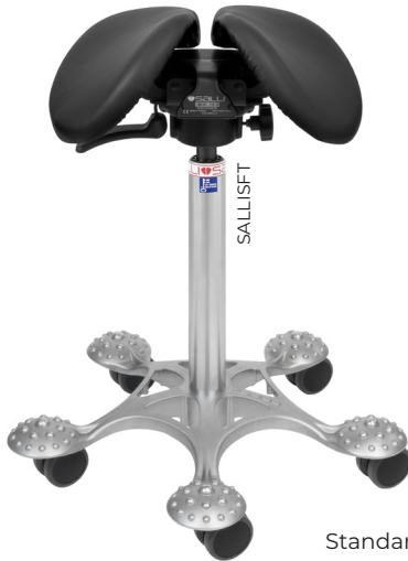
Standard: Salli Base