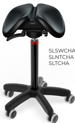
SLSWCHA SLNTCHA SLTCHA