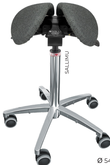
Ø 540 mm base