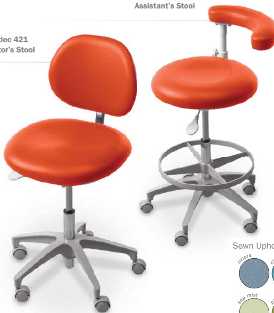
A-dec 422 Assistant's Stool