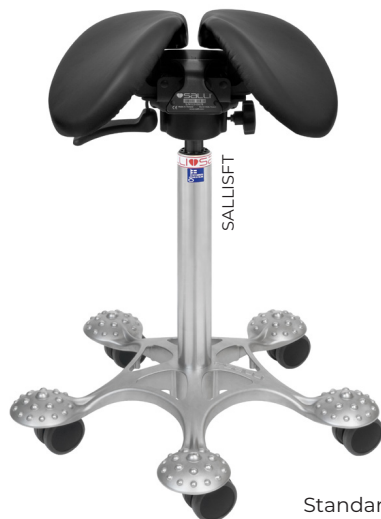
Standard: Salli Base