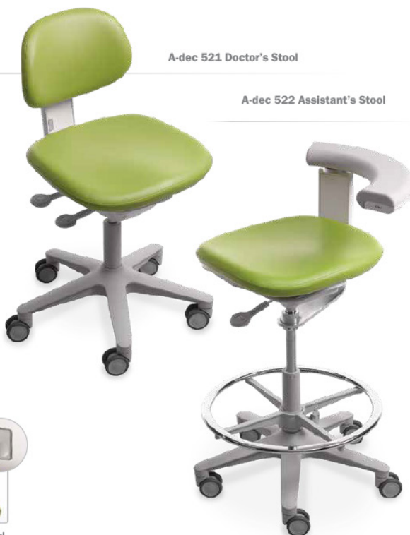
A-dec 522 Assistant's Stool