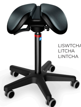
LISWCHA LITCHA LINTCHA