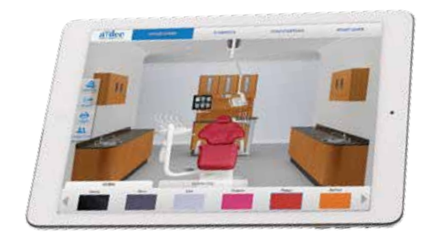
Order Your Samples at a-dec.com/InspireMe

Color makes all the difference in creating an environment that reflects you. That's why A-dec offers a wide variety of colors and selected options to coordinate seamless and sewn upholsteries.