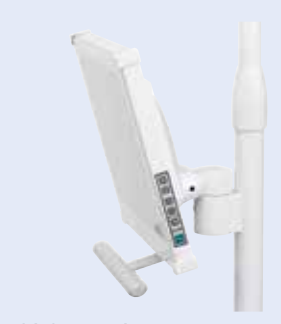
Light monitor mount