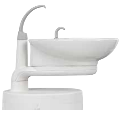
Rotating vitreous china cuspidor