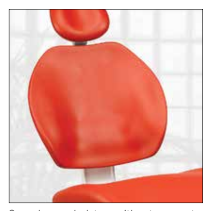
Seamless upholstery without armrests