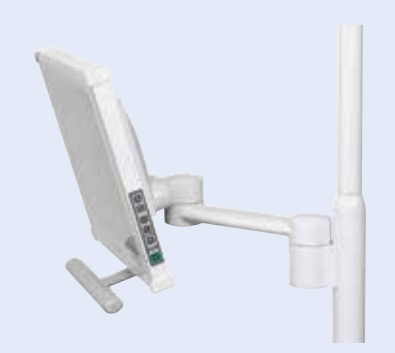
Light monitor mount with link arm