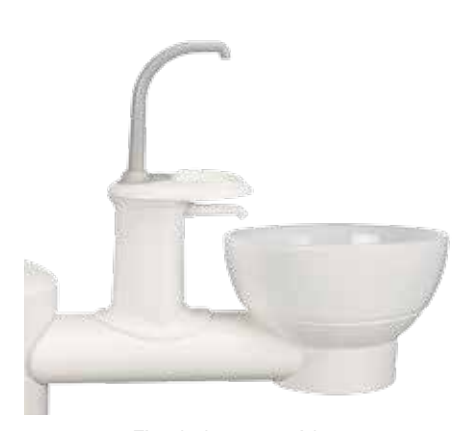
Fixed glass cuspidor