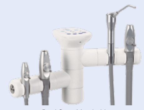
Dual 2-position holder