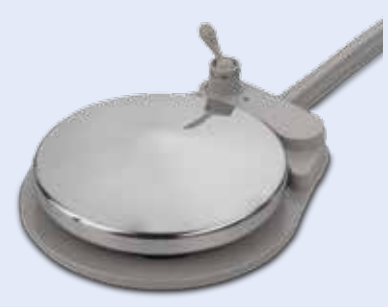
Disc foot control