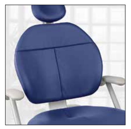
Sewn upholstery with armrests