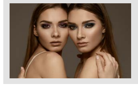
HYBRID PRO - 4.25% HP / 4.25% CP 3-4 HOURS WEAR OR OVERNIGHT

Boutique by Night 16% is a high strength formula that whitens your teeth as you sleep. This gel is tough on stains but gentle on teeth - our best seller!