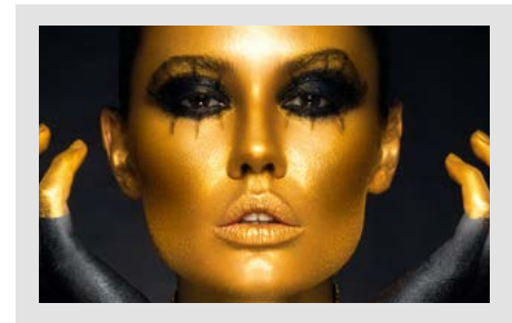
BOUTIQUE BY NIGHT - 10% CP 4-6 HOURS WEAR OR OVERNIGHT

Boutique by Day is designed for people who want great results with minimum wear time. The formula whitens your teeth with only 1.5 hours wear per day, perfect for those that don't want to wear appliances overnight.