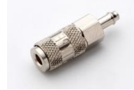
Quick Disconnect Coupling Item no. RV5000