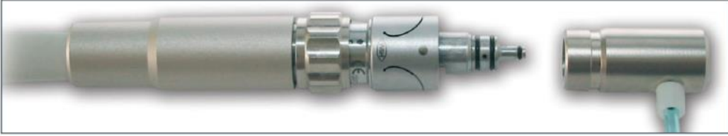
Connector S for Sirona Item no. 1935