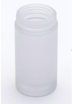
Powder Jar Item no. HF20190U1