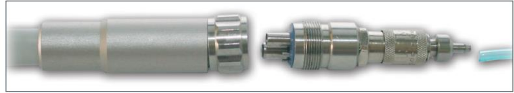
Connector MidWest Item no. 1930