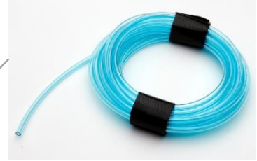
Hose (per 1m) Item no. HF20310U1